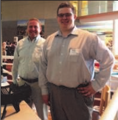
Cisick & Nester Insurance at their first PV expo!