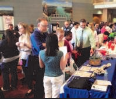
Swede Family Chiropractic enjoying a busy table!