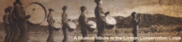
A Musical Tribute to the Civilian Conservation Corps